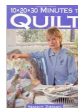
Sewing with Nancy's Favorite Hints